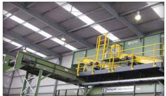
Recycling facility - the Netherlands