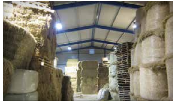
Barn - the Netherlands