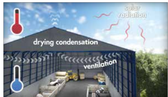
Drying during day time