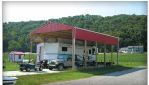
Carport - USA, Indiana