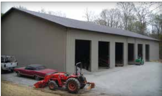
Storage - Ohio