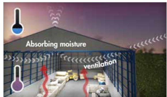
Absorption during night time