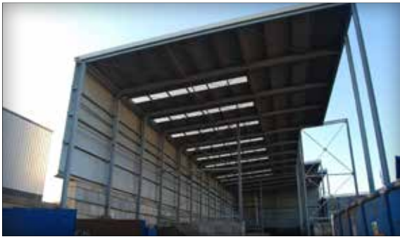
Open storage - the Netherlands