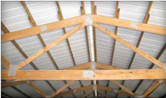
Pole Barn - USA, Indiana