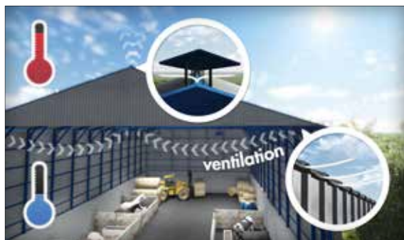
Ventilation is key